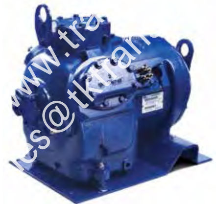
The 06D compressor. Evolutionary technology. Simple operation. Complete satisfaction.