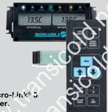
The Micro-Link ® 3 controller.